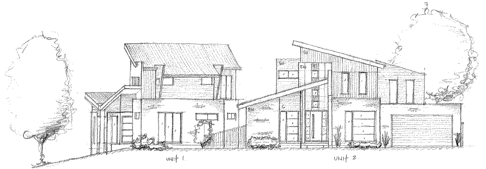
ILLUKA CRESCENT ELEVATION (SOUTH) 1:100